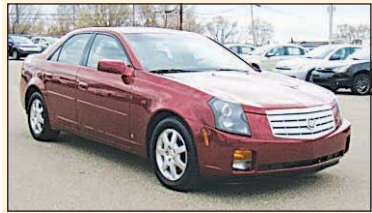
This 2007 Cadillac CTS is waiting at Dorian Ford for $14,995.

Cars.macombdaily.com features thousands of new and used car listings in one fast and convenient location.