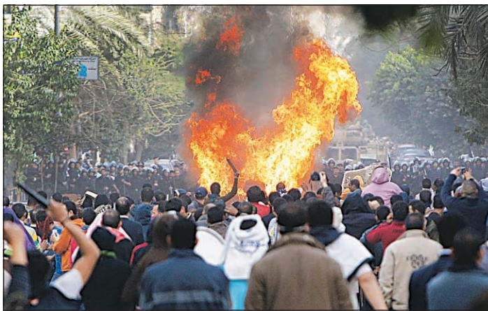
Protesters throw firebombs at riot police after police shot at protesters accompanying the funeral procession of an anti-government protester killed Friday in a street near Tahrir square in Cairo, Egypt, Saturday.

Saturday's fast-moving developments across the north African nation marked a sharp turning point in President Hosni Mubarak's three-decade rule of Egypt.